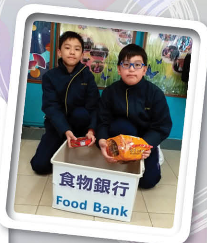
We helped out with collecting food from school students.