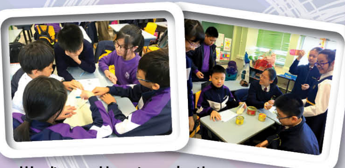
We discussed how to make the promotional videos.

P6 students helped to promote a food bank charity drive throughout the school. Students had to plan their work, write scripts, practise, perform in front of the camera and finally put their recordings into a video. Having an authentic situation to learn from made this a very valuable activity.