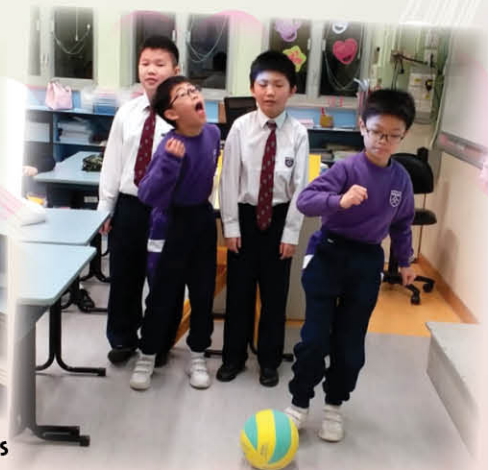
We demonstrated how to play the game "Kick the ball".