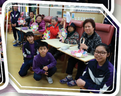
We sang songs and prayed for the elderly and we did Easter crafts with them.