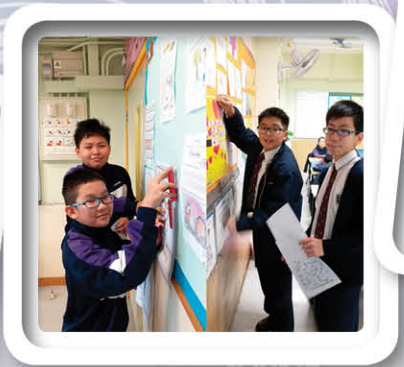
We prepared posters to promote the food bank charity drive.