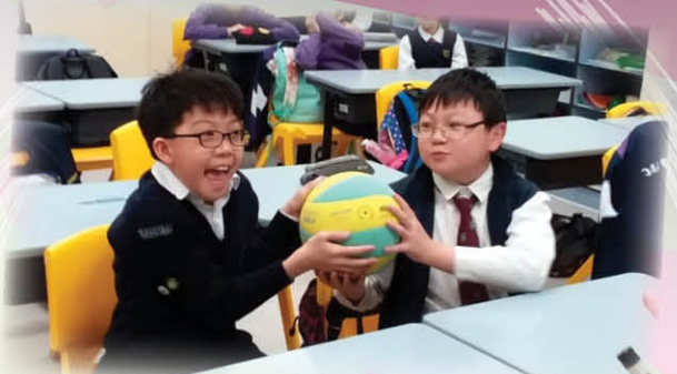
Let's show the elderly how to pass the ball.