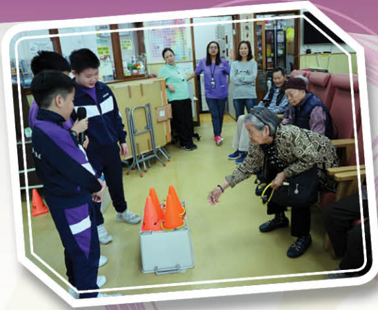
We played fun games with the elderly.