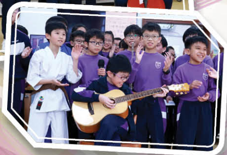
We played musical instruments for the elderly.