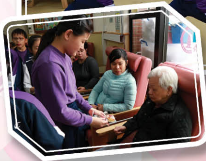
We performed Tai Chi for the elderly and we gave them presents.

P6 students helped to promote a food bank charity drive throughout the school. Students had to plan their work, write scripts, practise, perform in front of the camera and finally put their recordings into a video. Having an authentic situation to learn from made this a very valuable activity.